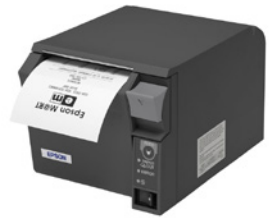
Epson TM-T70II Printer