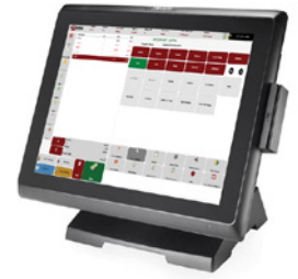
Pulse All-in-One featuring POSSible POS Software

“Our old system lacked the high-tech functionality the new solution provides,” he concluded. “It brought our technology into the 21st century.”